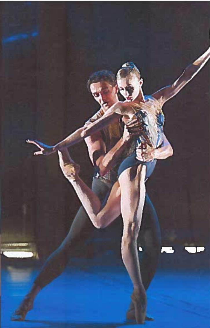
Clockwise from top left: in MacMillan's Manon ; Christopher Wheeldon's DGV: Danse à Grande Vitesse , McGregor's Infra ; Wheeldon and Alastair Marriott's Trespass